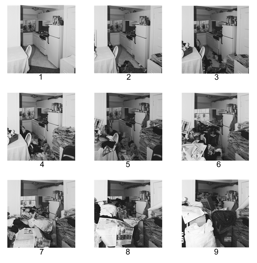
Figure 2.1 Clutter Image Rating Scale: Kitchen.

Please select the photo below that most accurately reflects the amount of clutter in your room.